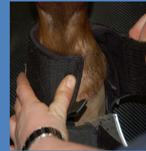
3. Put the welcro together