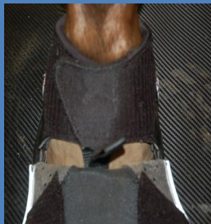
4. Align both velcro