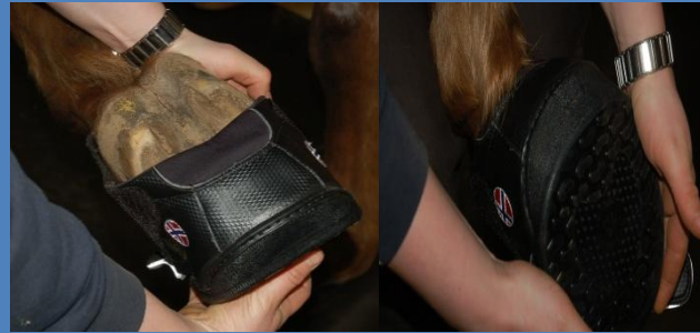
2. Place the shoe on hof