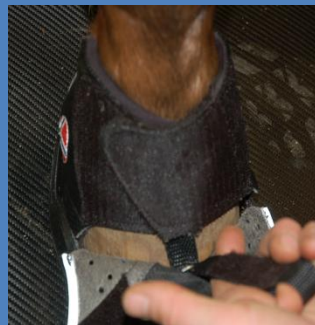
5. Pull the strap up and secure