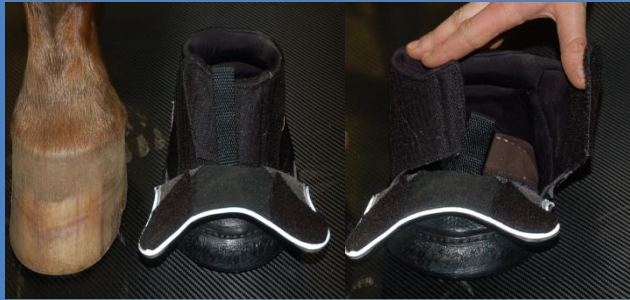
1. Open shoe widly