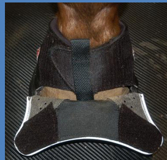
6. Flap the front part to closed position.